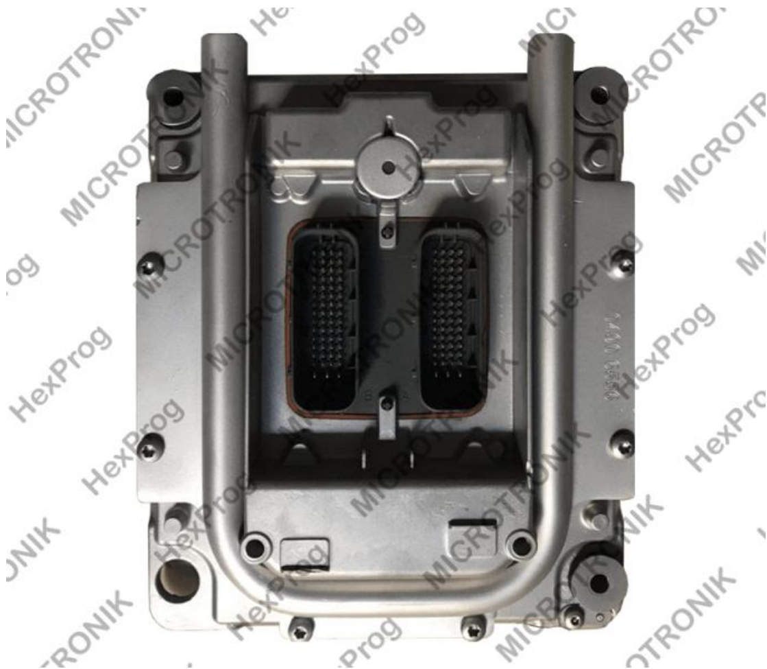
Volvo Buses-EMS2 E5-Module

You cannot use OBD Flash files to write into the ECU